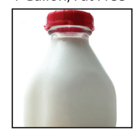
Retail: $4.19 Farmer: $1.64