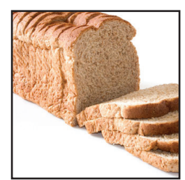
Retail: $2.69 Farmer: $0.17