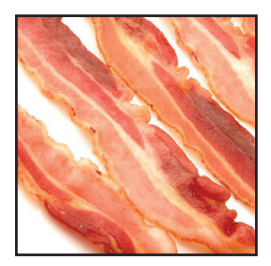
Retail: $6.06 Farmer: $1.04