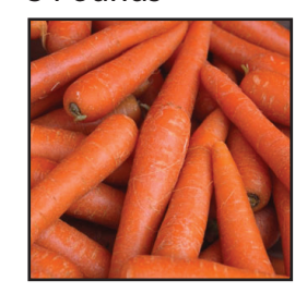
Retail: $4.39 Farmer: $1.53***