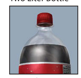
Retail: $1.49 Farmer: $0.11

Farmer's share derived from USDA, NASS "Agricultural Prices," 2013. Retail based on Safeway (SE) brand except where noted.